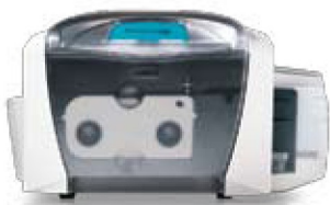
Persona C30e single-sided printer

The versatility of the Persona C30e also extends to card stocks. It can print on cards as thin as 9 mil and as thick as 40 mil. That includes the new thin ID cards all the way up to thicker smart cards with embedded electronics. Thin plastic cards are quickly gaining popularity around the world for health care, mass transit systems, highway tolls, parking, membership and customer loyalty programs. Because the cards are thin, flexible and lightweight, they're easy to mail, attach to a patient's chart or slip into a