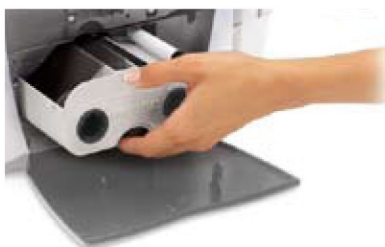
Load ribbons in a snap. The Persona's all-in-one printer cartridge lets you change both the ribbon and cleaning roller in one easy step.

The Persona C30e packs 30 years of printing technology development and experience into a simple, compact unit. It gives you outstanding performance and reliability at a much higher level than its price would suggest. When your organization needs a reliable, affordable ID card printer, the choice is simple — Persona C30e.