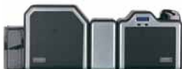
Lamination option and dual-sided printer/encoder